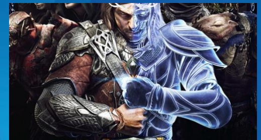
Warner Bros. Mittelerde: Schatten des Krieges