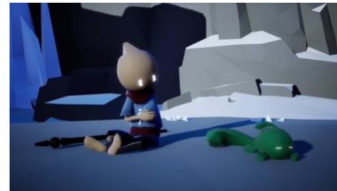
Future Friends Games Omno