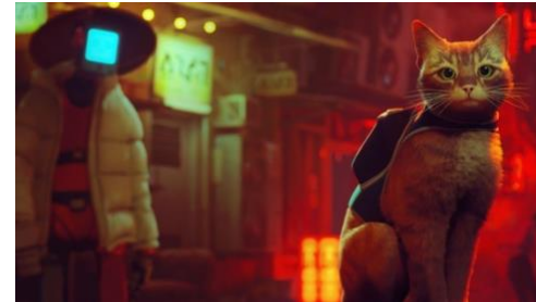
Annapurna Interactive Stray