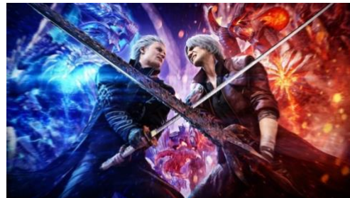
Capcom Devil May Cry 5