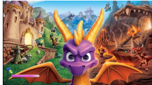
Activision Spyro Reignited Trilogy