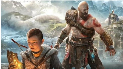
Sony Interactive Entertainment God of War

It's an honor to test and rate video games. There is a lot of work, dedication and creativity behind every published game. Both big and small publishers have pushed the game industry forward for decades. All the more we appreciate the recognition and trust in our work of numerous publishers such as: Activision, Bethesda Softworks, Capcom, EA, Nintendo, SCEE, Ubisoft, Warner Bros. and many more.