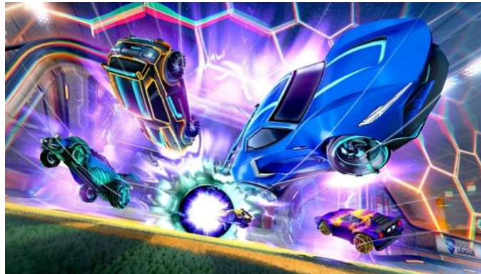
Rocket League - Psyonix