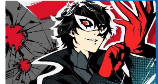
Atlus, Deep Silver Persona 5