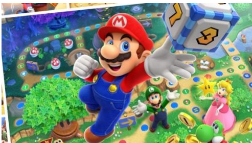
Nintendo Mario Party Superstars