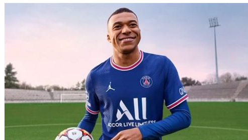
EA Sports FIFA 23