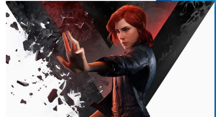
Control – Remedy