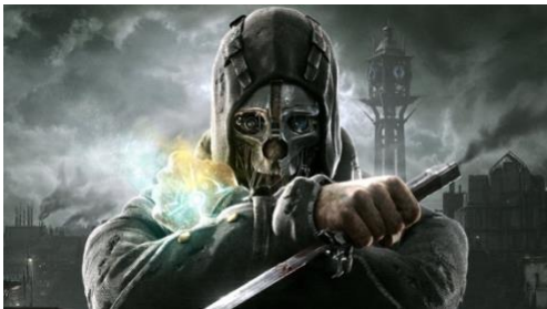
Bethesda Softworks Dishonored