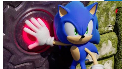
SEGA Sonic Frontiers