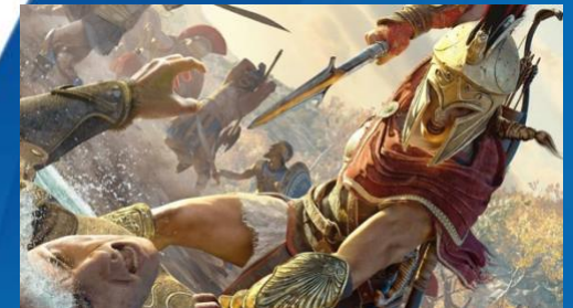
Ubisoft Assassin's Creed Odyssey